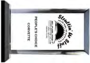
Example of Awards