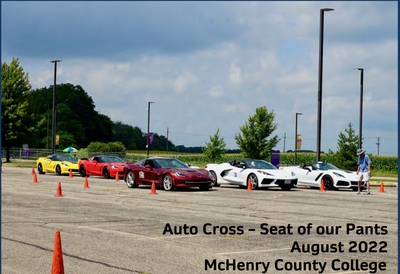
Auto Cross - Seat of our Pants August 2022 McHenry County College