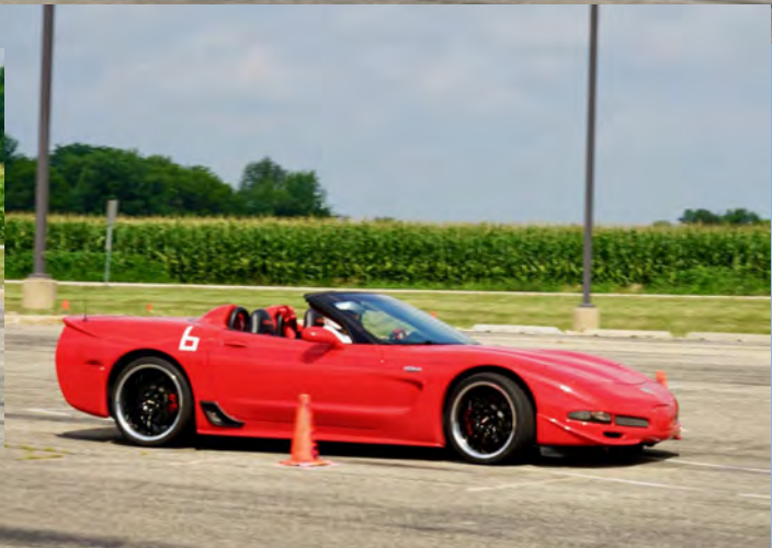
NCCC Auto Cross